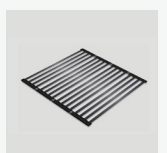
ACWSRM1596BK Black Workstation Roller Mat