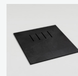
ACWSB1596BK Black Workstation Preparation Board