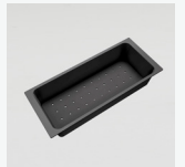
ACWSC1596BK Black Workstation Plastic Colander