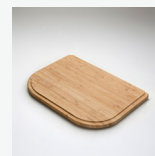
AC15 Bamboo Board