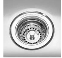
AC09 Basket Waste x 1