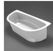
AC72W 'D' Colander