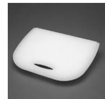
AC24 Synthetic Preparation Board