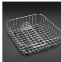
AC61 Stainless Steel Drainer Basket