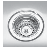
AC09 Basket Waste x 1