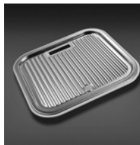
AC63 Stainless Steel Tray