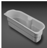
AC62 'D' Colander