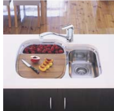
MO71U (With AC72, AC74 & optional PS113/1)