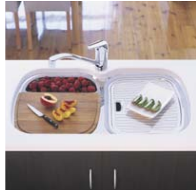
MO70U (With AC72, AC74, AC73 & optional PS113/1)