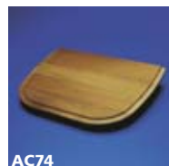
AC74 Solid Timber Preparation Board