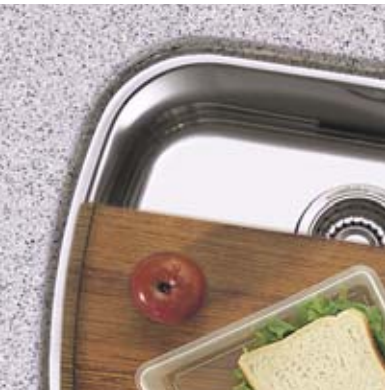
Accessory Lip Suits Oliveri's custom designed accessories.