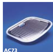
AC73 Stainless Steel Utility Tray