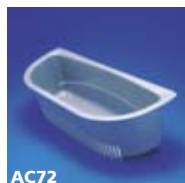
AC72 'D' Colander