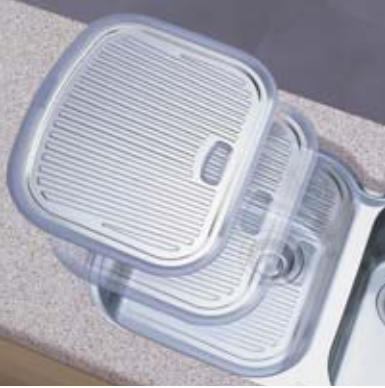
AC73 Stainless Utility Tray Extend the versatility of your Monet sink.

The Oliveri Undermount collection of stainless steel sinks are designed to make full use of your precious solid-surface benchtop space, without compromising Oliveri's legendary style and practicality. The intelligent design and range of genuine Oliveri accessories allows you to enjoy all the benefits of a smooth solid-surface benchtop combined with the sophistication of an Oliveri Sink. If it's not an Oliveri Undermount, it's a compromise.